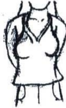
No halter tops