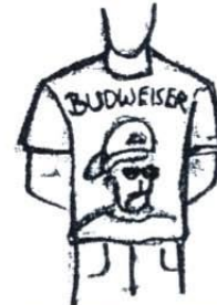
No profane/vulgar, discriminatory words/pictures or references to drugs/alcohol